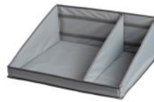
Divider Green Hotel